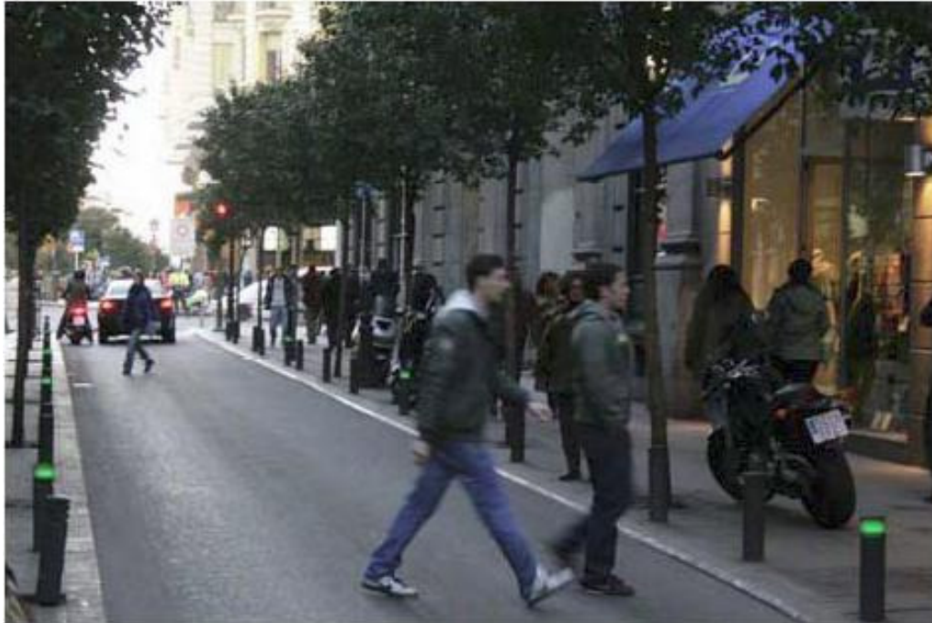
Figure 4. Proposed pedestrian priority signals along a length of street.

suggested by Lamíquiz Daudén and colleagues as a solution for Madrid (2008). This would be similar to the operation of standard signalised pedestrian crossings, where pedestrians and vehicles alternate periods of moving and waiting, but would apply to a whole section of the street. Signals could be placed on bollards along a stretch of road; when these signals are activated (green), vehicles would stop and pedestrians would be able to cross the road at any point (see Figure 4). The concept is based on system currently in place at very wide pedestrian crossings in Bilbao. The authors suggest this alternative would be particularly useful in shopping streets with high pedestrian traffic (up to 2000 pedestrians per hour) and moderate vehicle traffic (up to 1000 vehicles per hour), where there are no more than two lanes of traffic (to ensure visibility of the signals) and where the pavement is wide enough (at least 1.5m) for pedestrians to wait for their turn.