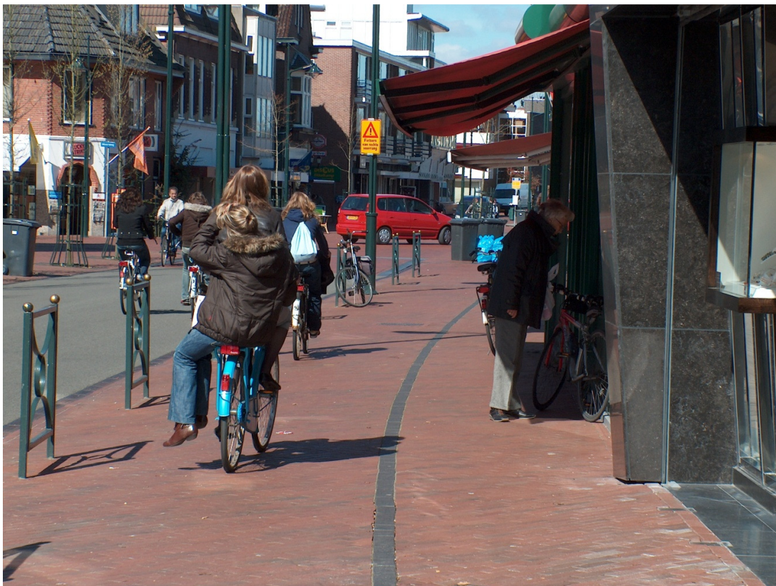
Figure 1. Rijksweg, Haren, NL shared space.

In the suburb of Haren (NL) the Rijksweg shopping street and two intersections were modified in 2003. The road and pedestrian zones are at the same level; along the street the road is asphalt, while paving extends across the entire intersections. Occasional fences, trees and lamp posts separate the pedestrian zone and prevent cars parking there. Traffic flow along the street is only 8000 vehicles per day (Gerlach et al, 2008), however one serious injury, 2 minor injuries and 32 damage only crashes occurred during the three years before conversion. During 2003, while the road was being reconstructed, there were 11 damage only crashes. In the three years afterwards, there were no injury crashes and 17 damage only crashes.