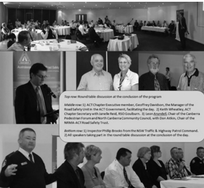
The collages & photos were provided by the ACRS and printed in the ACRS Weekly Alert No 72

The Seminar provided all the key stakeholders present with some clear messages and evidence to help focus their work together in the next few years. There was a strong recognition of the need to strengthen our work across the ACT / NSW borders, in particular to encourage ACT drivers to drive to the road conditions in areas they are unfamiliar with on roads off the main highway corridors.