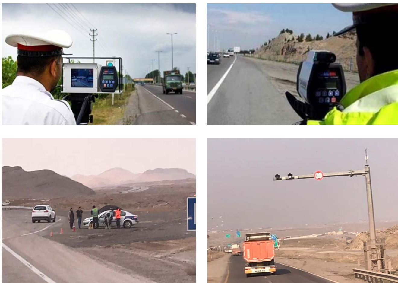
Figure 2. Police enforcement in Iran