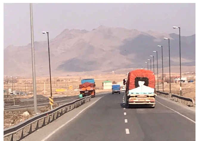
Figure 1. Vehicular traffic and road infrastructure in Iran.