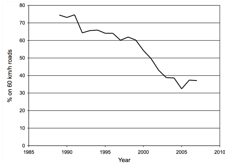
Figure 3: Pedestrian fatalities: Annual percentage on 60 km/h roads in Australia 1989 to 2007

Based on this incomplete information, the assumption is made here that 75 percent of pedestrian fatalities in Australia occurred on 60 km/h roads from 1975 to 1988. For the remainder of the period of interest there is accurate information, as shown in Figure 3. These two sources of information yield an estimate of 9,194 pedestrians fatally injured on 60 km/h roads in Australia from 1975 to 2007, inclusive. Taking the figure of a 30 percent reduction in pedestrian fatalities had the chosen limit been 50 km/h, the choice of 60 km/h for the urban area speed limit has resulted in the deaths of 2,758 pedestrians in Australia since 1974.