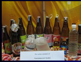
The various containers of Noncommercial Alcohol