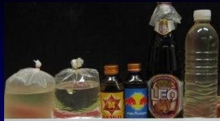
The various containers of Noncommercial Alcohol