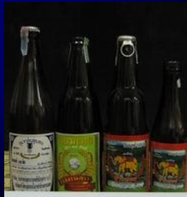
Non Commercial Alcohol from Northern region : Lampang province