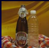
The various containers of Noncommercial Alcohol