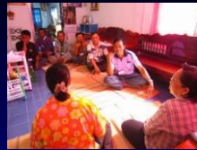
Northeast trip 12 – 16 March 2012