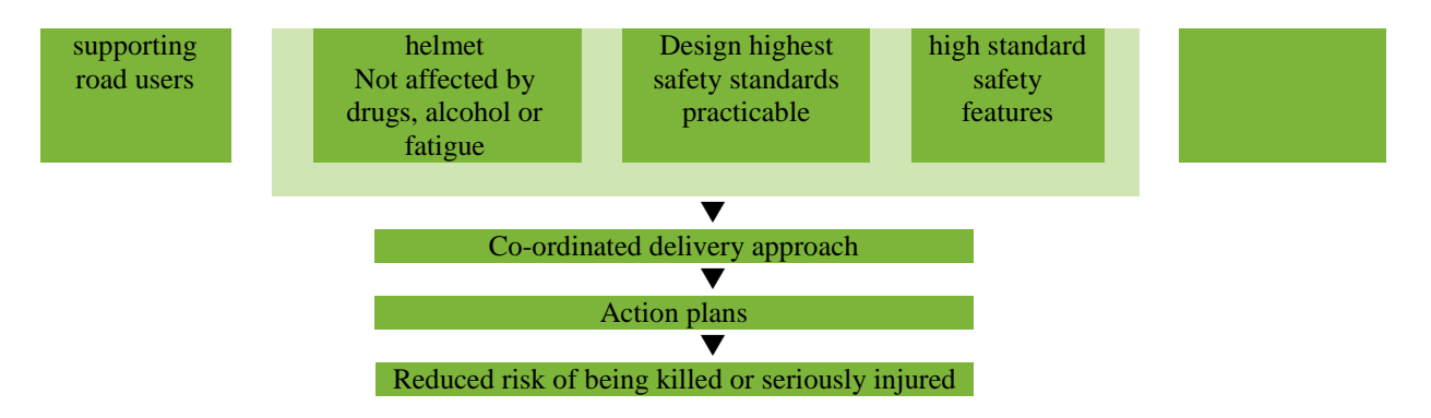
Figure 2 The Safe System framework: Adapted from VicRoads, 2008